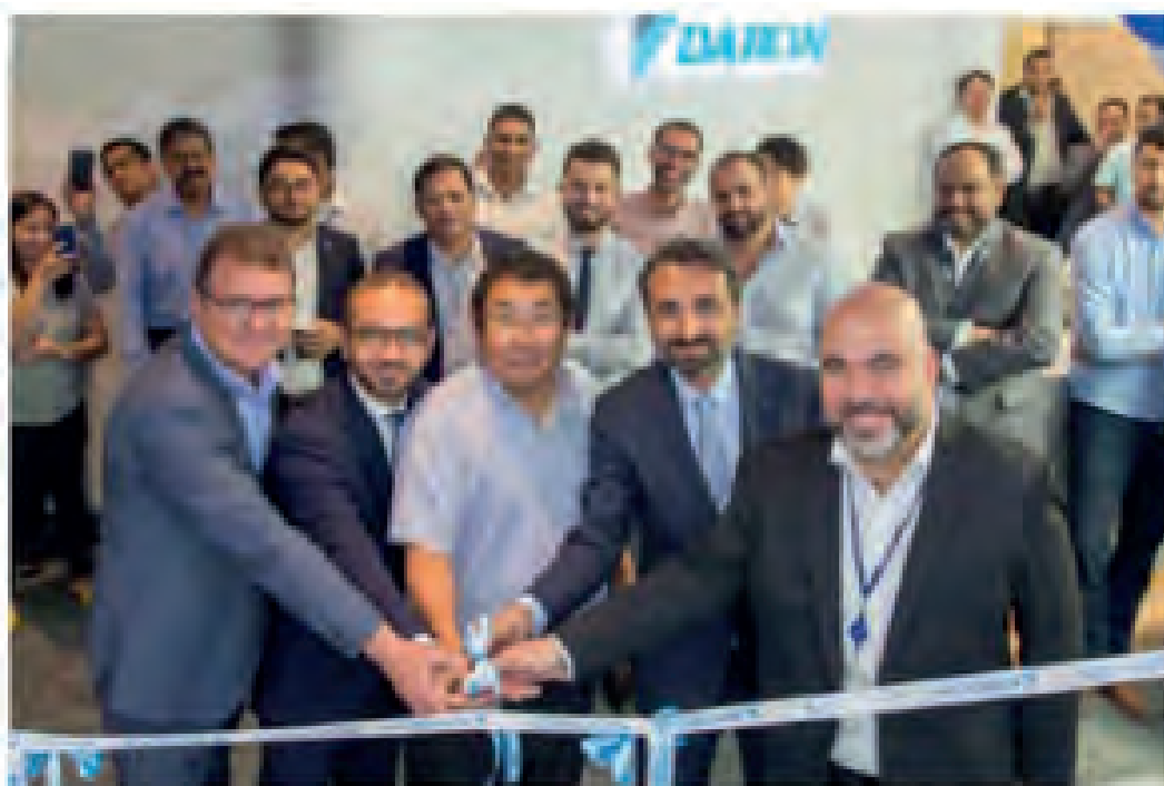
Ceremonial cutting of the inaugural ribbon

Publication Name: Saudi Gazette Country: Saudi Arabia