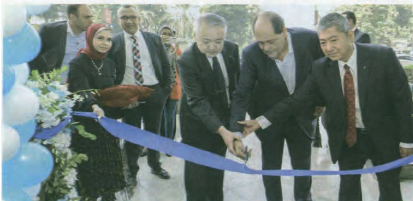
Officials during the opening of Daikin's new facility in Cairo, Egypt.

CAIRO: Daikin, the leading global innovator and provider of advanced, high-quality air conditioning, heating, ventilation and refrigeration (HVAC-R) products and solutions for residential, commercial and industrial applications, has revealed the opening of its new facility in Cairo, which is expected to help in the efforts to expand its presence in the Egyptian market. The opening represents a forward step in achieving the company's vision of consolidating stronger